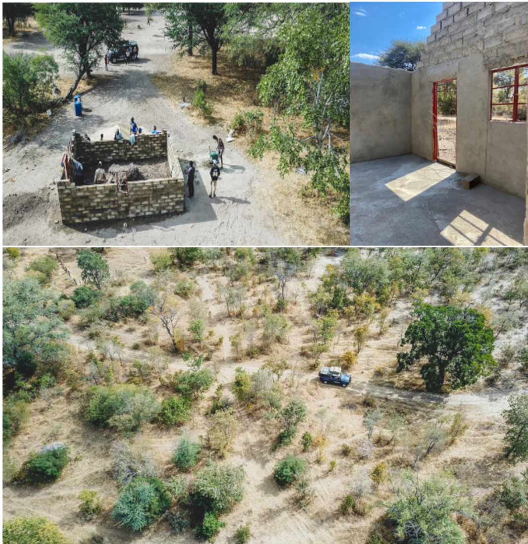
Figure 2 This picture shows the road to Shaditata to the new kindergarten and its construction

Mudiro built a new kindergarten in Shaditata, a very remote village 20 km from Andara towards Botswana (1.5 hours drive through deep sand). Until now, the village had neither a school nor a kindergarten. The young children from Shaditata walked 6 km to school in Shamaturu every day, usually without breakfast. Thanks to Mudiro's efforts, which took place over a period of three weeks, the community of Shaditata now has an IECD center, an important milestone for the local community. The success of the IECD project was highlighted in the collaboration with UNICEF. Mudiro was chosen as the partner of choice in promoting a pilot project to position IECD in Kavango East.