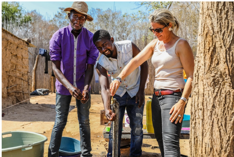
Figure 3 Mudiro and the local community in Andara have completed a new water project.

In total, Mudiro helped lay over 20 kilometers of water pipes in Kavango East last year. Another water project was successfully implemented for seven new households in Andara. Through the Meyu (Water in Thimbukushu) project, Mudiro is working to promote local community health while empowering local communities to take control of their own lives. By working together, hand in hand, Mudiro builds close collaboration on a social level, gaining the trust of the local community, a key aspect of building a sustainable development model in Kavango.