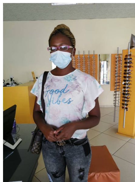
Figure 7 The student in Rundu with her new glasses