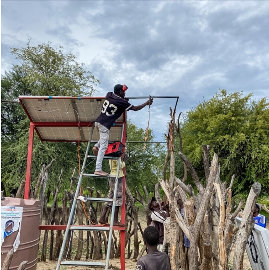
Figure 5 Mudiro and local community install solar panels in Shaditata

Mudiro procured additional solar panels to power water pumps to improve the inadequate water supply in Shaditata. Water resources for humans and animals are very scarce in this community. Mudiro installed the solar panels with many helpers from the village so that people and animals will never have to go thirsty again. This is an excellent example of achieving the Sustainable Development Goals at the community level with people by the people.