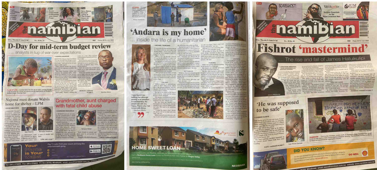
Figure 12 Mudiro in the newspaper in October 2020