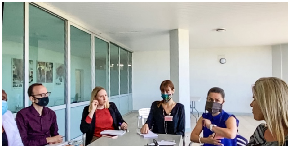
Abbildung 10: Meeting with UNICEF in Windhoek on the 26th of November 2020