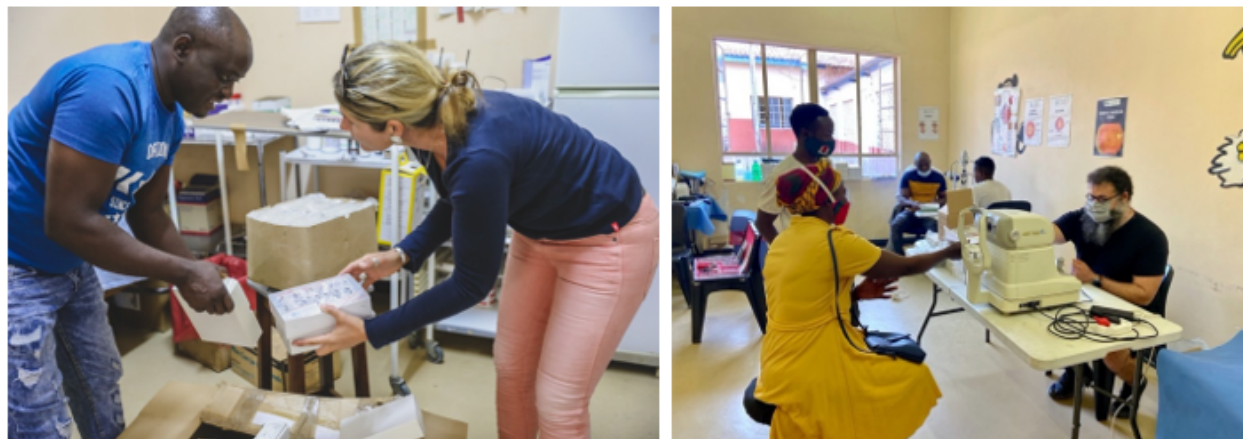
Figure 6 Mudirol and Luka Optics at Andara Hospital

in the Andara region. Patients pay between 20 and 100 Namibian dollars per pair of corrected glasses.