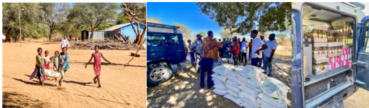
Figure 8 Mudiro and team distributing food in communities.

from us for the next four months. All households were listed with the government council of the Kavango region and statistically documented for all donors.