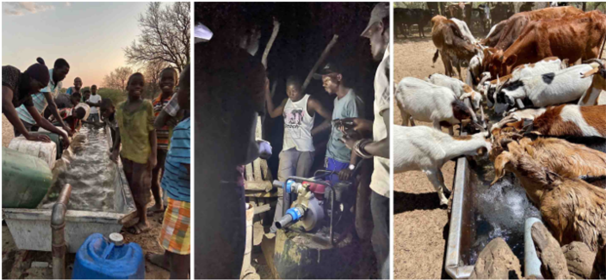
Figure 4 Mudio and the local community helped the people of Shamunaro with fresh water

The well in Shamunaro broke on September 16, 2020. Mudio immediately mobilized five young men from Andara. Together, they transported in a total of 5,000 liters of water with two off-road vehicles in just one working day. The population received water first. Already by 9 p.m. the first cows and goats could be provided with fresh water. However, it was clear that just carting in water would not solve the long-term problem therefore Mudio repeatedly tried to ask the local authorities for their support in dealing with the water supply. The Rundu municipality only responded after four weeks and repaired the diesel generator. The cohesion in and with our group after this success was great, greater than expected, which led to further increase the trust and respect of the local people for Mudio.