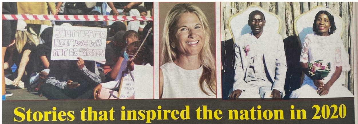
Figure 11 Mudiro in The Namibian newspaper, 22th of December 2020.

The overall level of awareness of our work is increasing as the numbers of our missions grow, the doctors and health personnel, as well as the kindergartens we have built in Kavango East. The whole country heard about Mudiro, and the famous musician EES integrated the Swiss NGO in his music video. Despite COVID-19 we were strongly networked and praised. We are proud of what we have achieved and look forward to what more we can do in Northern Namibia.