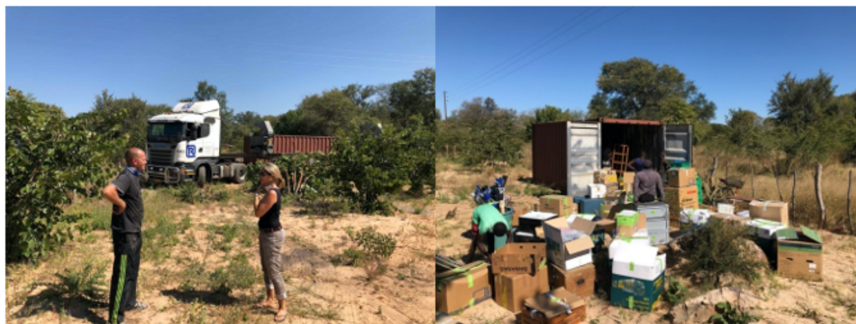
Figure 9 The Mudiro container has arrived in Andara